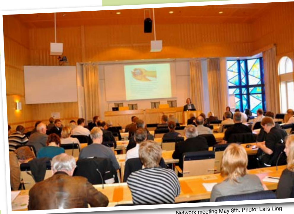
Network meeting May 8th.

The municipality of Umeå: will arrange a workshop for members around new forms of contracts and procurement for better cooperation and quality towards partnership.